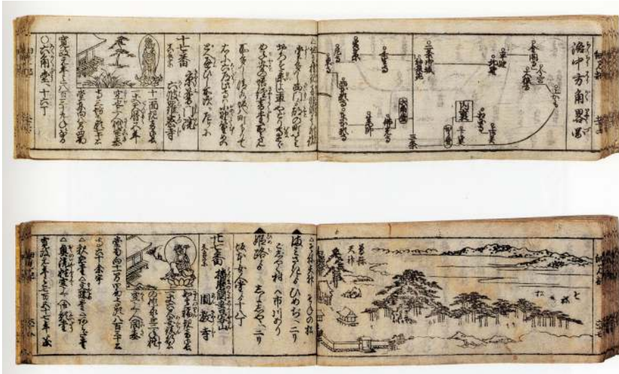
Fig. 4 Historical guidebook of the Saikoku pilgrimage, woodblock printed booklet, ink on paper, H. 7.9 cm, W. 18.2 cm, dated 1791, Nagoya City Museum.