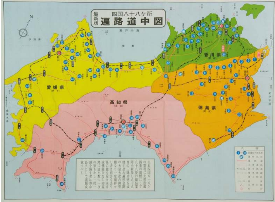
Fig. 3 Map of the Shikoku Pilgrim's Way, modern print on paper, H. 38 cm, W. 53.5 cm, private collection.