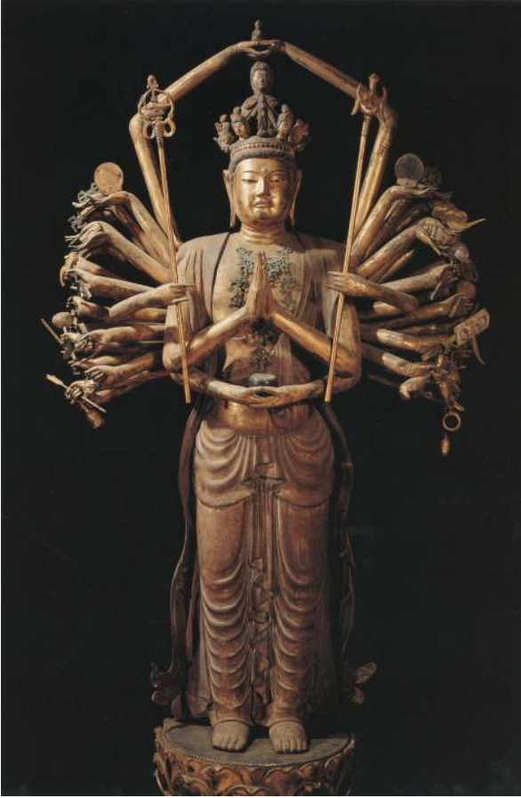
Fig. 5 Statue of Thousand-armed Kannon, wood with color and gold foil, H. 192 cm, 13th century, Ryūhō-ji, Kanagawa Prefecture.

but were still in some competition with the others. This is how the uneven distribution of the six forms at the thirty-three temples can be explained. 17