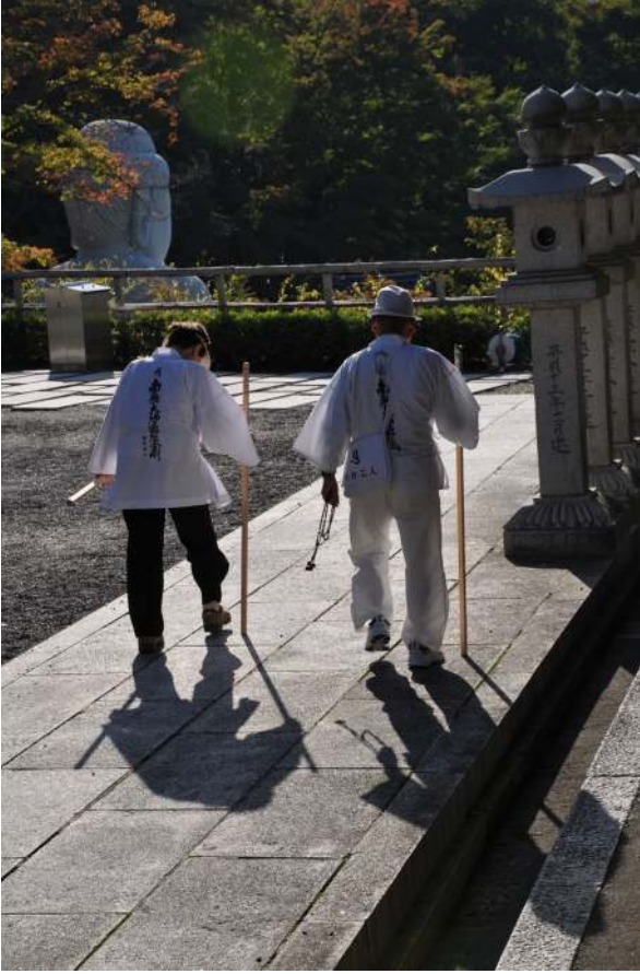
Fig. 2 Two pilgrims with traditional staff and clothing at Tsubosaka Temple near Nara, Japan, 2008.

The precepts regulating the ritual procedures of the Japanese Buddhist pilgrimage including recitations, songs, time of travel, clothing etc. are specific enough to ensure a fixed, identifiable frame of reference (Fig. 2). At the same time, there is ample scope for individualisation for both a single pilgrim as well as an organized group. As will be shown further below, this particular dynamic between authoritative ritual precepts and individual creativity can be said to be the main reason for the long and stable continuity of this religious tradition in Japan.