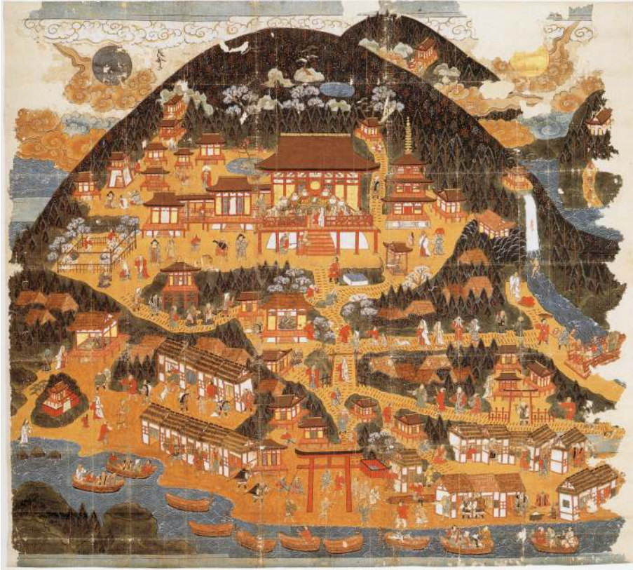
Fig. 7 Temple Chōmei-ji Pilgrimage Mandala, hanging scroll, ink and color on paper, H. 148.2 cm, W. 165.2 cm, 16th–17th century, Chōmei-ji, Shiga Prefecture.

already been referred to above. Indian monks also played a significant role in this context. Hōdō Sennin 法道仙人, a monk and ascetic from India who allegedly lived in the 6th century when Buddhism took root in Japan, is said to have founded number 16 on the Saikoku pilgrimage circuit, Kiyomizu-dera, and many other temples in Japan. Legends about this figure were circulated especially in the Kamakura period in the 12th and 13th centuries when indigenous forms of Buddhism were formed in Japan. Another Indian monk is said to have initially had a vision of Kannon during his austerities under the monumental Nachi waterfall. This 4th century Indian monk, Ragyō Shōnin 裸形上人, had become shipwrecked in a storm off the southern coast of Japan. He created a small statue modelled on his vision of Kannon and lived at Nachi until his death. Hundreds of years later, a Japanese ascetic named Shōbutsu 生仏 sought to emulate Ragyō Shōnin and underwent austerities under Nachi waterfall as well, for a thousand days. Finally,