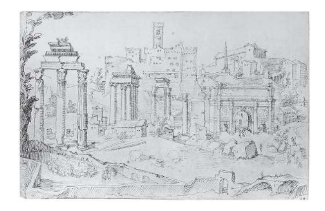
Fig. 5 Maarten van Heemskerck, View of the Forum Romanum to the northwest (Marten van Heemskerck, Album I, fol. 06r).