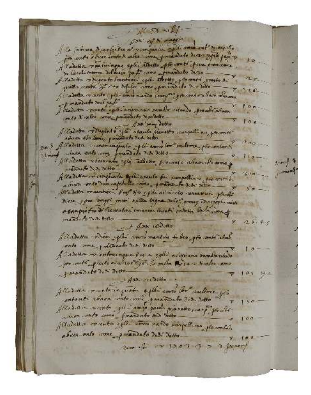
Fig. 2 Repro from the Archivio della Reverendissima Fabbrica di San Pietro, Arm. III, tom. 10, p. 53v. Accounts of material acquired for the construction of St. Peter's Basilica stating the price and in some cases its provenance.

short notices and receipts of every kind for building material that was brought to the construction site.