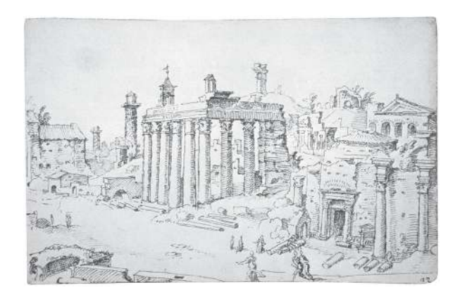
Fig. 6 Maarten van Heemskerck, View of the Forum Romanum to the northeast (Marten van Heemskerck, Album I, fol. 09 r).

monuments or their ruins from the Renaissance, although there are drawings of every surrounding building on this end of the Forum Romanum.<sup>40</sup>