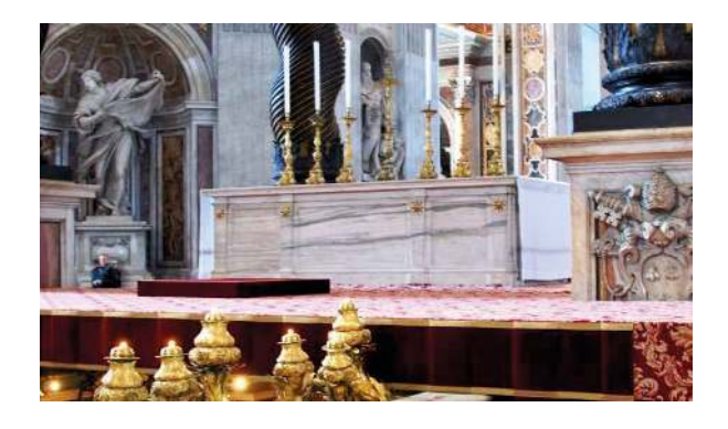
Fig. 7 The papal altar in the Basilica of St. Peter.