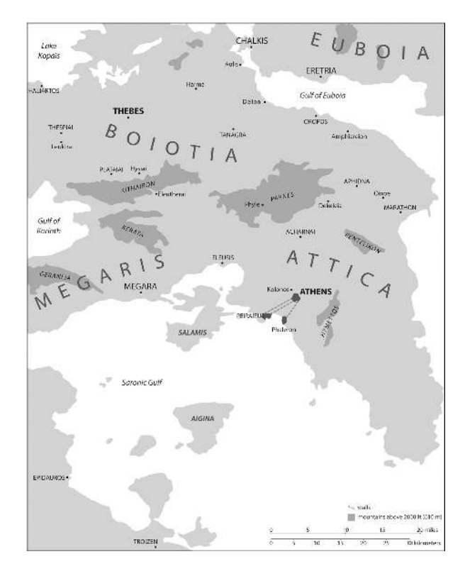
Fig. 2 Map of Attica and environs.

that a Boiotian village near the Attic border was called Harma (Chariot), either after the chariot of Amphiaraos, the seer of the Seven, or after that of Adrastos. <sup>120</sup> According to the latter myth, Adrastos – after the crash of his chariot in Harma – "saved himself on Areion", <sup>121</sup> just as in the epic Thebaid . <sup>122</sup> Strabo mentions another Harma across the border in the vicinity of the Attic deme of Phyle. <sup>123</sup> The people living near this chariot-shaped mountain top also sought a connection to Adrastos' chariot, but, in their version, the horse Areion apparently played no role: "Adrastos was saved by the villagers", <sup>124</sup> who might have escorted him to their king, as Jacoby suggests. <sup>125</sup> Another place in Attica, Kolonos Hippios (Horsehill), <sup>126</sup> located two kilometers north of Athens on the road to Thebes, was also connected to Adrastos' flight. There was "an altar to Poseidon Hippios