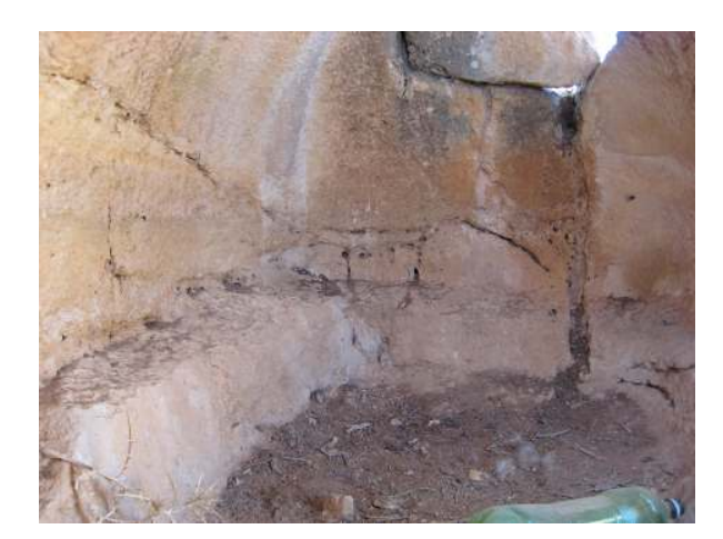
Fig. 4 Dolmen at Maqam Issa, used as an overnight place, likely by a shepherd; containing remains of food, pieces of wood and a plastic bottle.

identifiable and datable finds has led to intensified search for objects that are directly associated with dolmens, in the hopes of finding traces of temporal and functional relevance.<sup>56</sup> The wider surroundings remain completely neglected. This research strategy leads to a Third Space of second degree. If one were to design a research strategy for those in-between spaces, only a microarchaeological approach could be successful, since it is highly unlikely that substantial material remains are preserved in a landscape left open since hundreds if not thousands of years.