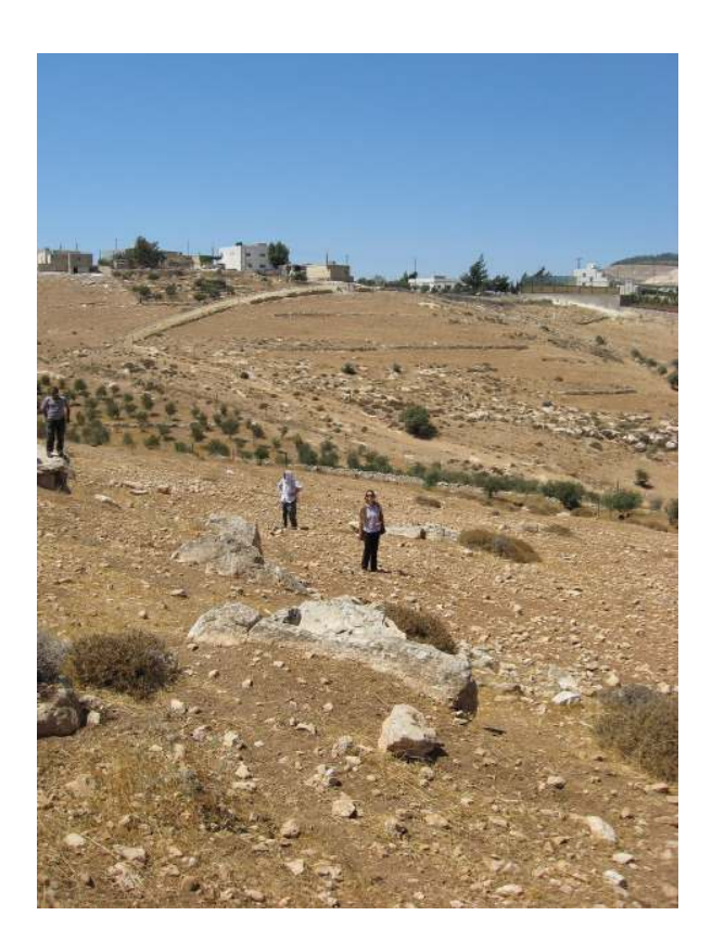
Fig. 2 An overview of the western part of the dolmen field of Maqam Issa, as seen from the south.

fields resist temporal and other determinations not only because of insufficient research. Rather, this vagueness will remain, regardless of how much money is spent on surveys and excavations to enlighten us about their original contexts. The reason for this apparent problem is that they are ancient non-places. These megaliths did not mark spaces of identity, as I will try to show by commenting on their chronology, spatial distribution and supposed function(s).