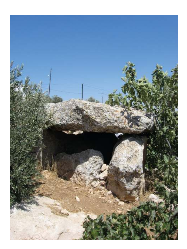
Fig. 3 Maqam Issa. Dolmen in a field of olive trees, used as a shed for tools.

The topographic situation of most dolmen fields deserves attention as well. In search of meaning and significance of archaeological places, we are often inclined to tap into strategic-economic or political 'factors'. For this purpose trade routes, boundaries between ecotopes, waterways or other features are invoked and analyzed with GIS and other complex procedures. But what happens when these traditional archaeo-logics fail because they simply ask the wrong questions? What if there are no specifiable utilitarian reasons for the location of monuments, and there never were? I suspect that the Jordanian dolmens are a good example of anti-utilitarian and therefore unexplainable locations. They occur in uncharacteristic spaces in topographically variable areas: not on ridges, nor in valleys, not aligned, but rather strewn along slopes. Maqam Issa is a good case in point. One result is that they are in peripheral landscapes where neither agriculture nor major building activities occurred until very recently.